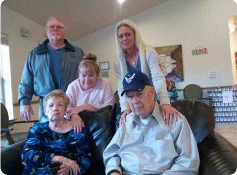
Family w/Dad @ Mayberry Gardens 2019