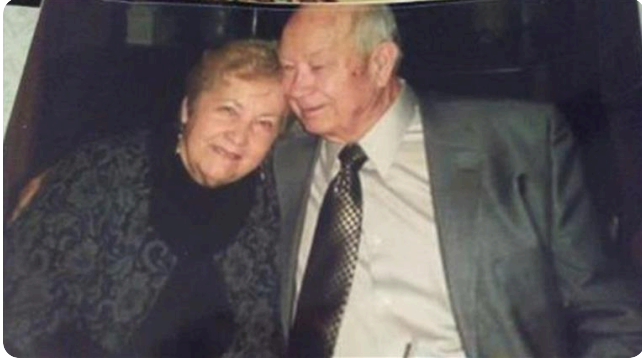
Mom & Dad